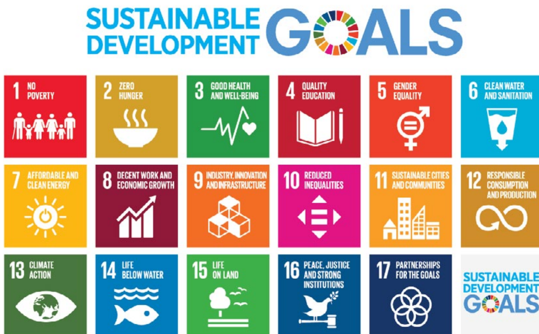
Figure 1 | Sustainable Development Goals

According to Lima and Da Silva (2021), the SDGs of the 2030 Agenda are integrated and indivisible, and their targets should be monitored and evaluated at the global, national, and regional levels. The axes of sustainable development are related to human existence itself, and it is the responsibility of the public sector and the private sector, including businesses, institutions, and civil society, to take measures for their implementation. The 17 sustainable development goals of the 2030 Agenda are: